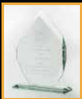
ATSSA 2015 Innovation Award

The Halo Light is endorsed by the American Association of Safety Councils and has won 17 awards including: