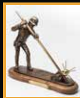
Construction Innovation Forum NOVA Award