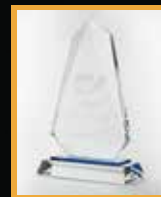
Occupational Health & Safety New Product of the Year